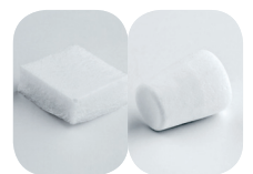
Jason fleece® collacone®